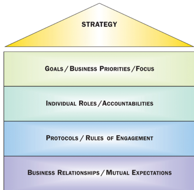
FIGURE 2: Key Alignment Areas